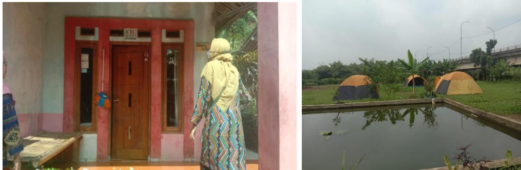
Fig. 3. Homestay and Camping Ground

Ecotourism in Keranggan has several tourism programs as can be seen in Figure 3.