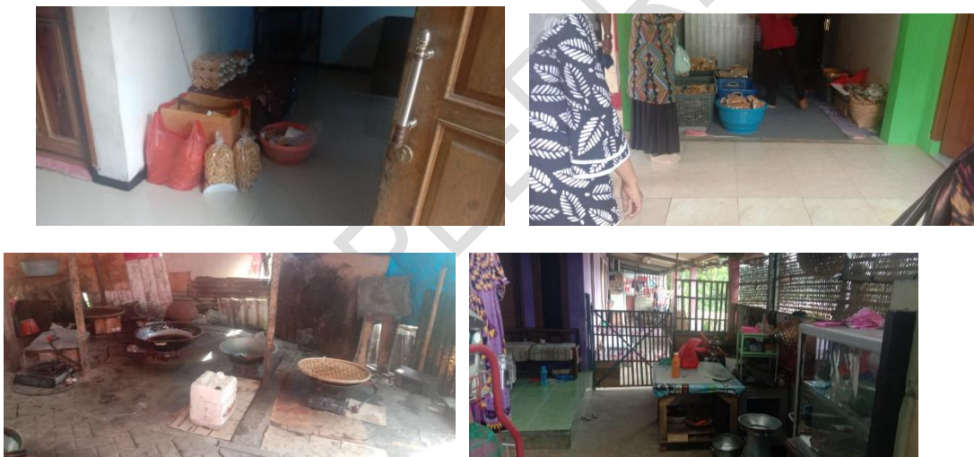
Fig. 4. Home Industry Keranggan Village

Figure 3 is a Homestay and Camping Ground which is one of the tourism programs in Ecotourism Village Keranggan. Homestay and Camping Ground are overnight tourism programs offered to tourists, while non-stay tourism programs are Home Industry tourism programs, as can be seen in Figure 4.