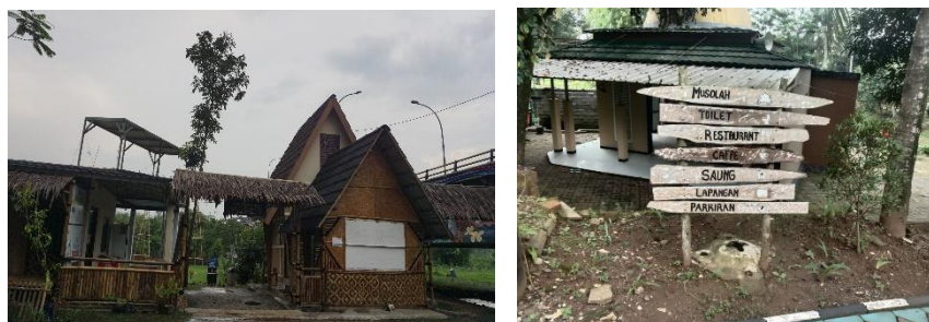
Fig. 5. Tourism Information Center (TIC) and Signboard

The physical and non-physical carrying capacity in the village of Keranggan can be seen in Figure 5.