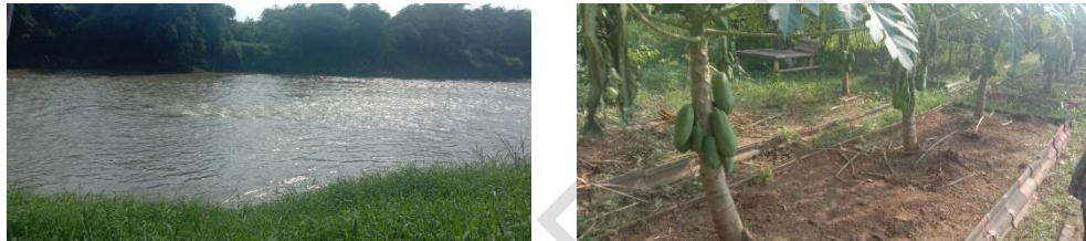
Fig. 2. Cisadane River and Pick Tour

From the results of observation and documentation techniques carried out by researchers, the attractiveness of Green Tourism in the Ecotourism area of Keranggan Village can be seen in Figure 2.