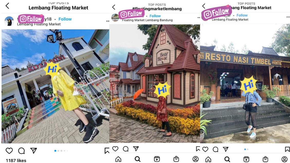
Fig. 2. Instagrammable attraction at Floating Market Lembang

In addition, this location is also developing a Mini City which is an artificial attraction with the concept of a miniature building with European architecture. The manager also provides a Rabbit Park which is a rabbit breeding place which is often used as a photo object for tourists. The floating market also has one of the natural attractions such as water rides that take advantage of the potential of the lake. At the same location, tourists can also enjoy culinary delights of various types of traditional foods.