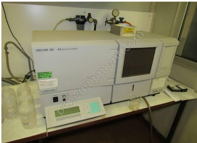
Fig. 2: UNICAM AA 919 atomic absorption spectrophotometer

Heavy metals concentration of the water and crab samples were determined using the Atomic Absorption Spectrophotometric Method. The dried samples of crab were put in a cleaned dried mortar separately and were grounded to fine particles and then sieve using a sieve of particle size 0.02 mm. 0.5 g each of samples were measured into clean dried beaker (100 mL), 5 mL of aqua regia HCl and HNO 3 (3:1) was then added to the sample for digestion. The samples were allowed to be evenly distributed in the acid by stirring with a glass rod and then the beaker was placed on the heater. The digested sample was filtered into a graduated cylinder and the filtrate was made up to 50 mL using distilled water. UNICAM AA 919 atomic absorption spectrophotometer model was used to analyse the concentration ( \mu\text{g/g} ) of heavy metals in the six different samples of crab (Mebom et al , 2021).