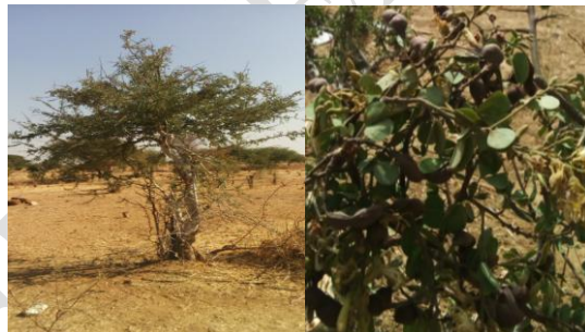
Figure 1: B. rufescens in its natural environment.

The plant material used for this work consisted the leaves and stem bark of B. rufescens , collected in December 2017 in Abeche, eastern Chad (13° 49' 0" North, 20° 49' 0" East.), and identified at the Botanical Unit of the Livestock Research Institute for Development (UBIRED) in N'djaména, Chad, under the reference IRED/LRVZ 1325.