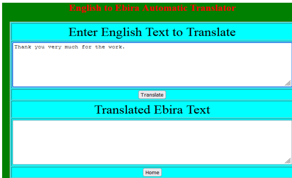
Figure 2.1: Sample translation Interface