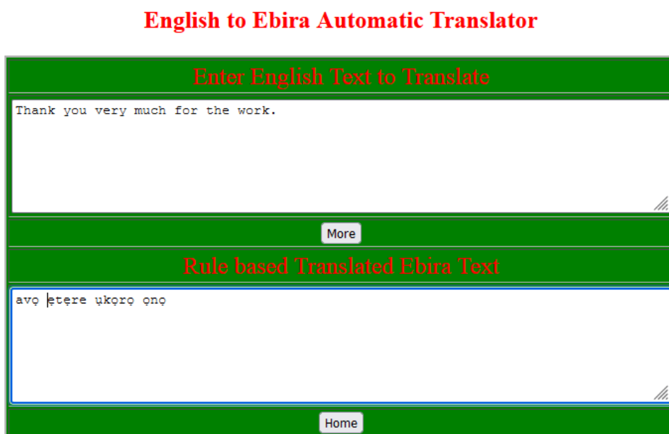
Figure 2.2: Sample translation Interface

After entering the text to be translated and then click Translate , the result is shown above.