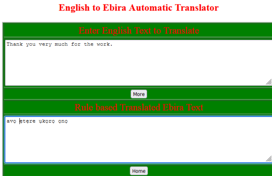
Figure 2.2: Sample translation Interface

After entering the text to be translated and then click Translate , the result is shown above.