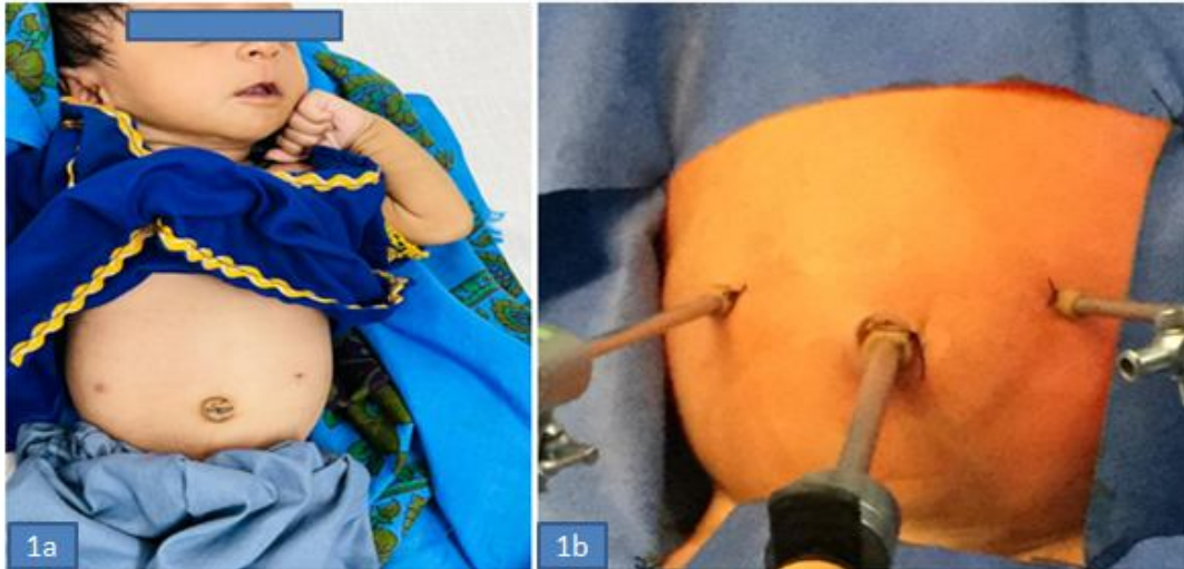
Figure 1a: 03 laparoscopic ports 1b: minimal post operative port marks

adrenaline dose not exceeding more than 7mg/kg block given immediately after Induction of general Anesthesia by using 0.5%lidocaine with adrenaline at the dose of 7mg per kg in every patient . OT temperature was maintained at 34°C. Neonatal Infant Pain Scale (NIPS) was used to measure the postoperative pain.