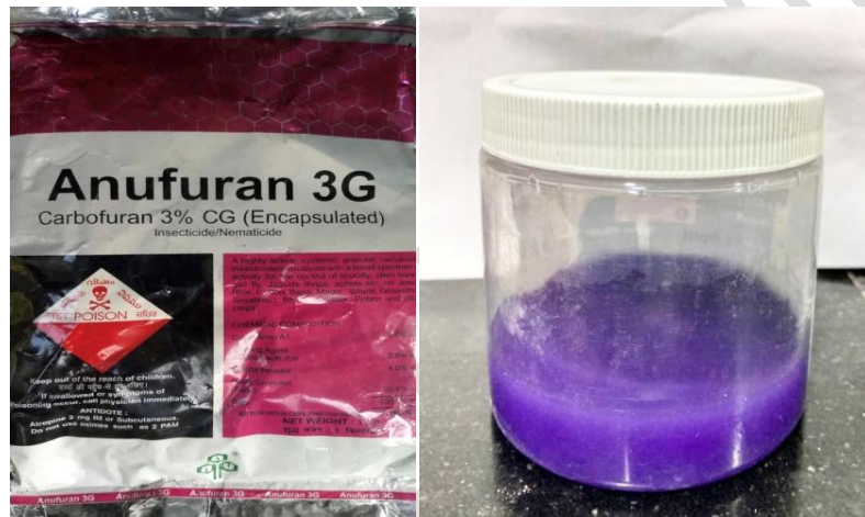
Figure 1a: The commercially available OP compound used in this assessment

Organophosphorous compound: ANUFURAN 3G, carbofuran 3% CG was available as solid purple crystals and it had a very strong pungent odor; in which the odor sustained until the entire process of tooth immersion (figure 1a & 1b).