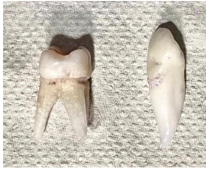
Figure 2 shows a newly extracted natural tooth that was exposed to an OP compound solution for an hour. The cervical region and the apical 1/3rd of the tooth have a slight purplish tint.