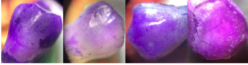
Fig3 picture represents Amelogyphics patterns of labial surface of maxillary premolars staining of tooth using hematoxylin(3c,3d) and toluidine blue(3a,3b) by soak method and studied under stereo microscope