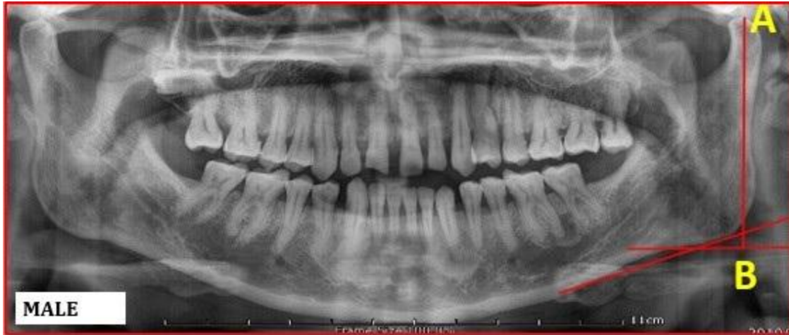
Figure 1: Represents the projective ramus height measurements.