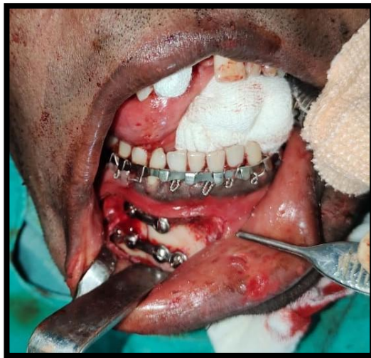
Fig 1 Morphology

miniplates and closed with 3-0 vicryl and 4-0 ethylon suture material in layer wise suturing technique (fig 1). Upper palatal split was reduced and fixed with 2mm thick three holed plate followed by placement of arch bar and occlusion was gained. Later the knee's approach was used to explore the Le-forte fracture with respect to the right side. Right side ZMC fracture was reduced and fixed with three 2 holed with gap miniplate. (fig 2). Pyriform aperture reduced and fixed with four holed with gap miniplate and closure was done with 3-0 vicryl. The patient was watched, and antibiotics and analgesics were prescribed as postoperative treatment. After a week, the further oral sutures were removed. The patient made a full recovery and had a smooth recovery. For one month, the patient was prescribed a soft diet. To keep the occlusion, postoperative elastics were used after 4 days. With an almost unnoticeable scar, postoperative stability and functioning were good.