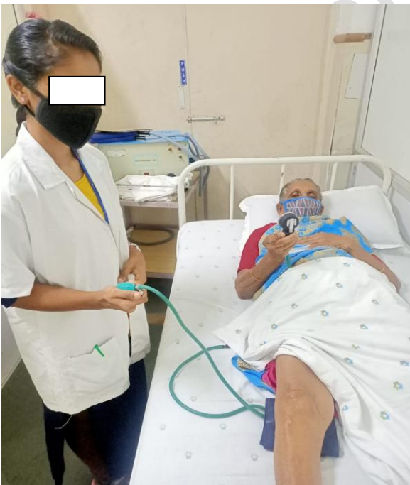
Bio feedback equipment used by subject while performing knee movement while lying