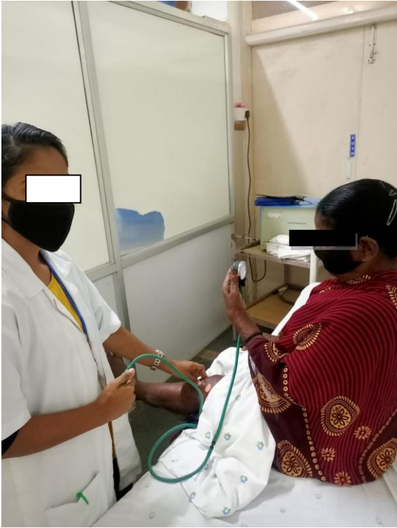
Bio feedback equipment used by subject while performing knee movement while sitting