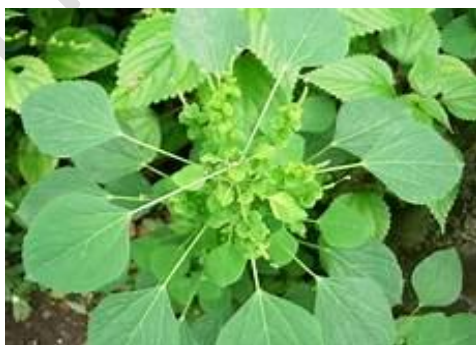
Fig .1 Acalypha indica Linn. [5]