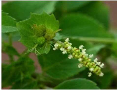
Fig .2 Acalypha indica flowers [6]