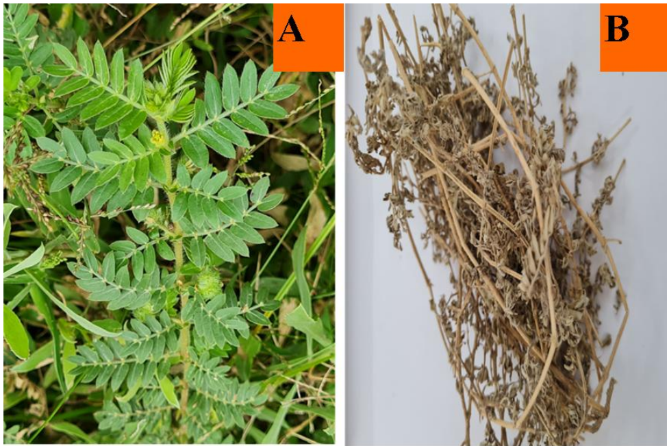
(Figure 1) Showing A. Whole Fresh plant of T. terrestris Linn. B. Whole Dry plant of T. terrestris Linn.