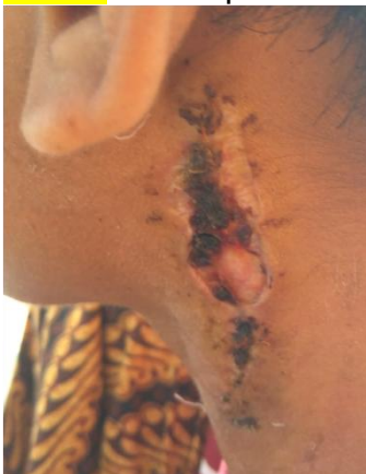
Fig 1: A red open wound, measuring 15 x 5 cm, accompanied by exudate, scabs and pain.

A seventeen-year-old man presented with a one-month history of lesions in his left neck that had not healed after keloid removal surgery. One week after surgery, the surgical suture broke and became an open wound, then exudate developed over time. The patient had no prior history of immune system dysfunction and was not on any immunosuppressive medications, although he was a chain smoker. The patient was hemodynamically stable and had a normal body temperature when examined. A red open wound approximately 15 x 5 cm was discovered on the left neck during a dermatological check, along with exudate, scabs, and pain. (Fig 1). The patient was given antibiotics intravenously first. After cleaning the lesion with NaCl, one fingertip unit of 10% Wharton's Jelly-derived Mesenchymal Stem Cells Conditioned Medium (WJMSCs-CM) topical gel was applied. The patient was also given WJMSCs-CM topical gel to be applied at home with the same dosage twice daily for two weeks. The patient was monitored online during home care. Seven days after the intervention, the regeneration and healing had begun. The lesion appeared to be clean, with reduced erythema, scabs, and pain. (Fig 2). After two weeks, the lesion was improved. The size of the lesion has reduced and turned into a closed wound. The patient was really pleased with the outcome. (Fig 3).