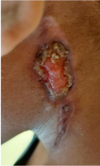
Fig 2: After seven days later by applying 10% Wharton's Jelly-derived Mesenchymal Stem Cell Conditioned Medium (WJMSCs-CM) topical gel.