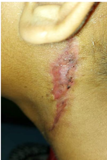
Fig 3: Two weeks later, the lesion was improved. The size of the lesion has reduced and turned into a closed wound.