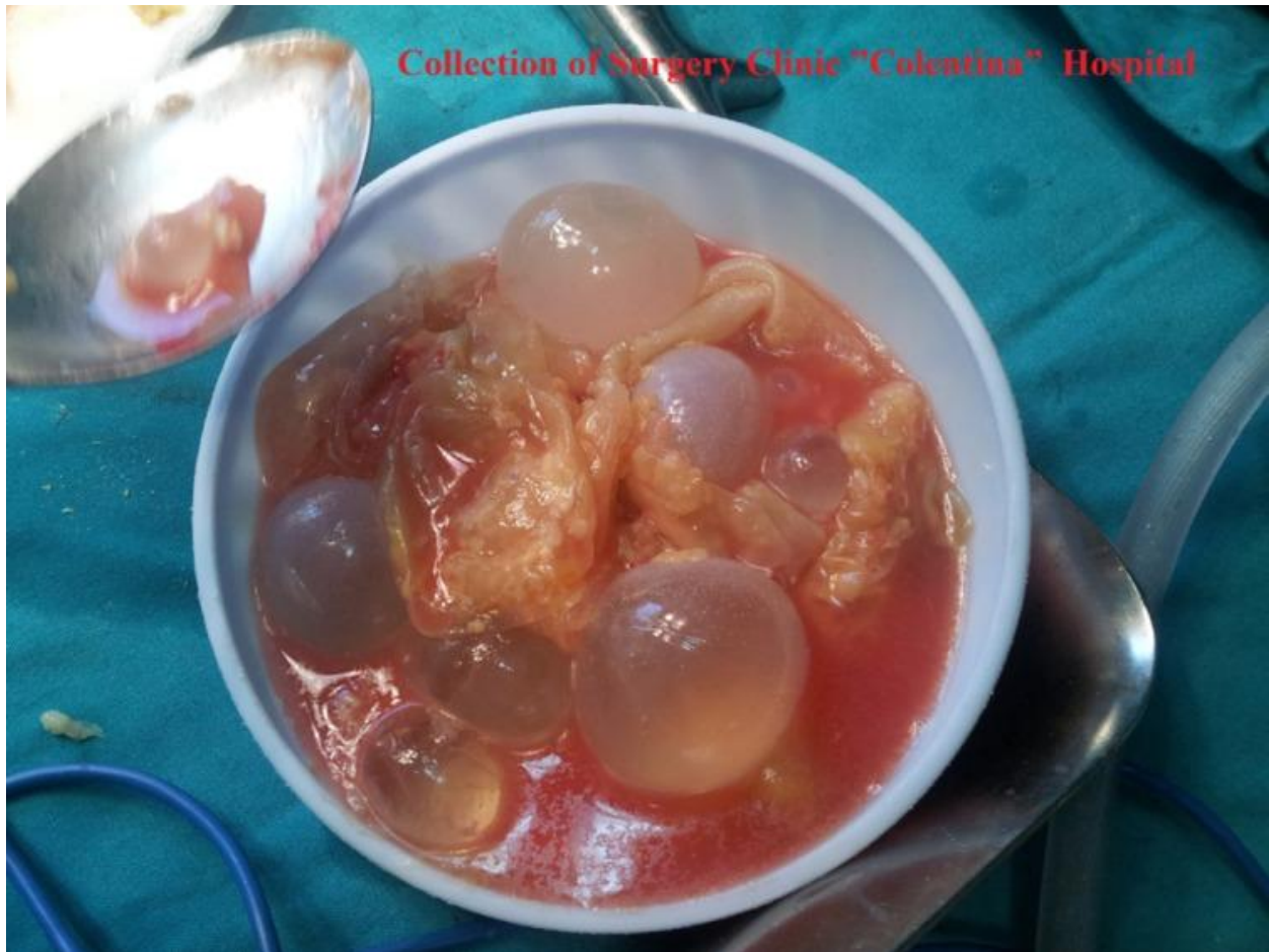
Figure:1 Collection of surgery clinic “Colentina” hospital

In some cases, asymptomatic hydatid cysts are diagnosed when they become symptomatic. The cysts gradually grow (1-2cm/year), and unless the brain is affected, it is rarely diagnosed during childhood or adolescence. The incubation period is months to years and even decades.