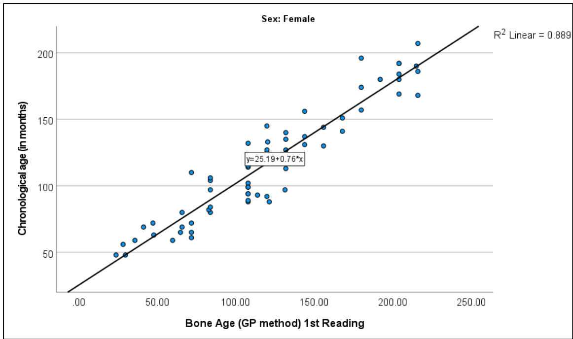
Figure 4: Scatter plot for Correlation between Chronological age and Bone age by GP method [Reading after 15 days-Male]