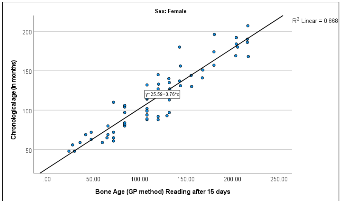
Table 6: Regression equation for estimation of Chronological age by GP method (Male)