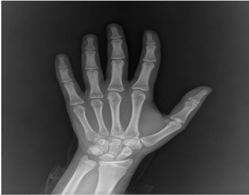
Figure A: Example of left-hand X-ray, PA view