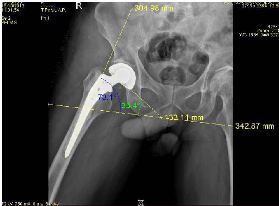
Fig 2. Xray of pelvis

Now, B2 is the difference b/w angle B and B1 which represents total amount of abduction of the hip in the operated limb.