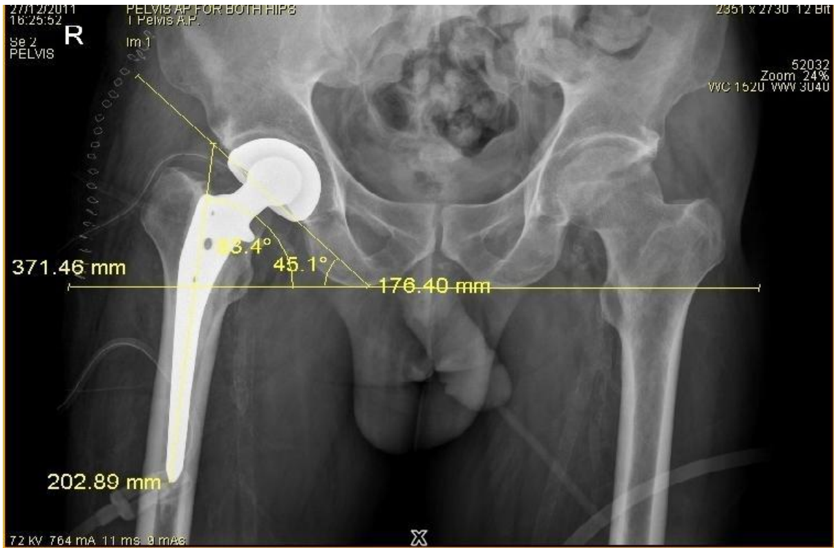
Fig 3. X-ray of pelvis with both hips (neutral position) with Bipolar prosthesis on right side showing

Angle A – 45.1 and Angle B – 86.4 degrees.