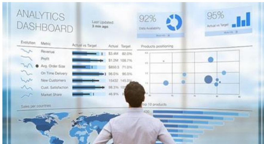
Figure 3: Multi-Dimensional Dashboard for Blockchain Data Analytics

The first challenge for the block chain is its failure to manage the clinical data transaction rate. Blockchain records modifications to a limited volume of data (such as balance of accounts, identity of the owner, etc.). On the other hand, the costs involved with creating a massive ledger to record a large amount of data, and the difficulty involved in doing proof-of-work on this ledger, prevent storing a large amount of data on the blockchain [12]. Proposed solutions include that using a different approach to consensus than proof-of-work, verify evidence using proof-of-stake. Patient data can be held on private (permissioned) regional blockchains with throughput capacities to support high transaction volumes while being validated only occasionally.