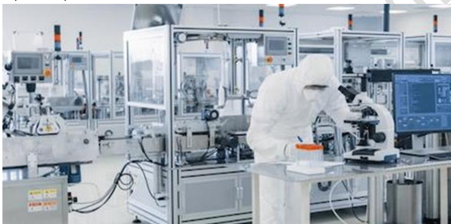
Figure 1: Health Data Analytics

institutions or data lakes, to point to where the actual data is stored. The following citation describes an app that functions similarly to the Healthcare Data Gateway, but it is created by people from China, and its main feature is that it enables patients to monitor and directly manage rule-based access to their health information via a smartphone interface and authentication enabled by a blockchain network. Those proposals promote the principle of medical evidence held by patients which will have the effect of decentralising medical information in a manner that is still undetermined [3].