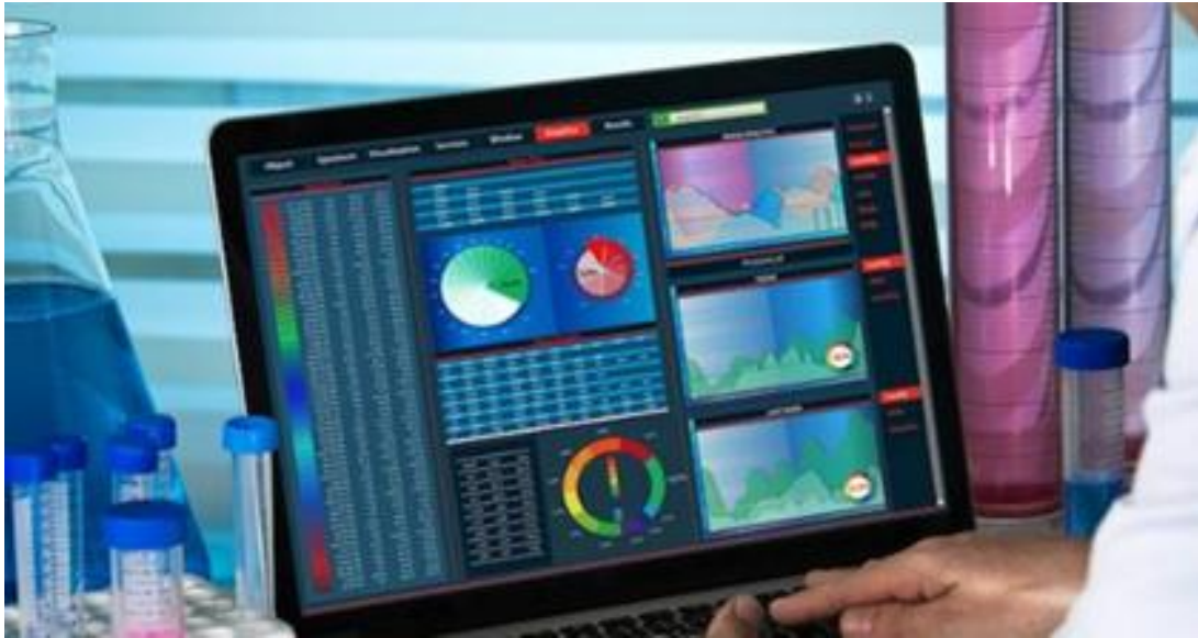
Figure 2: Dashboard for Blockchain Data Analytics

Because meaningful application stage 3 is being introduced in healthcare institutions, a drive has been made to develop patient-oriented application programming interfaces (APIs), which enable patients to retrieve their records directly from the hospital and to share them with the provider as necessary.