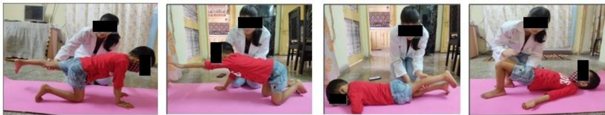
Figure 4: Pelvic stabilization exercises (Leg lift tabletop, tabletop arm lift, leg lift and Bridging exercise)