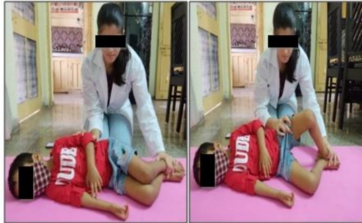
Figure 3: Pelvic stabilization exercises (Starting and end position for clam)