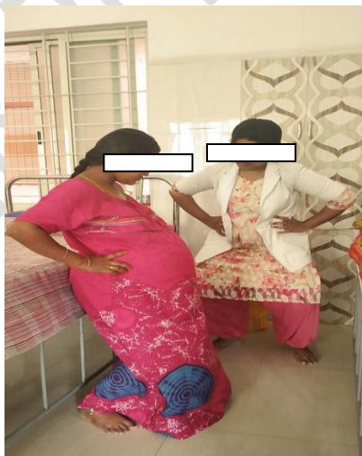
Figure 1: exercise program 1 skeletal muscle PressPlie's (I.E., Squats with Outturned Knees)

The head is in a neutral state, not wanting to go down or up to an excessive degree. The chest is proudly front. The back isn't rounded forward, and there isn't an excessive amount of anterior girdle tilt (over the arch of the lower back). The knees trail behind the second and third toes. By corporal punishment a full range of