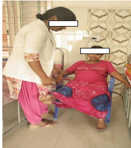
Figure 2: exercise program 2 Active knee resisted exercise

motion, squatting to a depth where the hip crease is below the knees offers the best effects. They were instructed to hold their position for four seconds and then return to their original position. This practice should not be repeated if you don't want to tumble down.