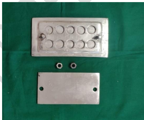
Mold for testing abrasion resistance (Fig. no:1)

A circular metal mould of size 15mm in diameter and 3mm in depth will be used. (Fig. no.:1). Chloramine-T will be weighed 50mg Chloramine-T per 100grams of type III gypsum product. For the control group type III gypsum product will be mixed with a bowl and spatula. For experimental group admix of type III gypsum product and 0.5% of chloramine-T will be mixed with bowl and spatula. The mix will be poured separately in the mold.