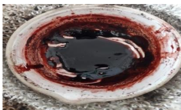
Fig. 1. Extracted beet root pigment