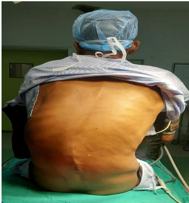
Fig 1. On examination of spine a lateral curvature present with kyphoscoliosis.

Patients all routine that is complete blood count, LFT and KFT are within normal limits. Pulmonary function tests showed mild to moderate restrictive pattern. The surgery was planned under spinal anaesthesia. Patient was nil by mouth for 8hrs for solids and 2hrs for water. Informed and written consent obtained from patient and his family.