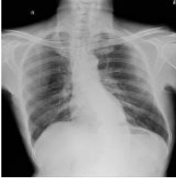
Fig 2. X-ray image