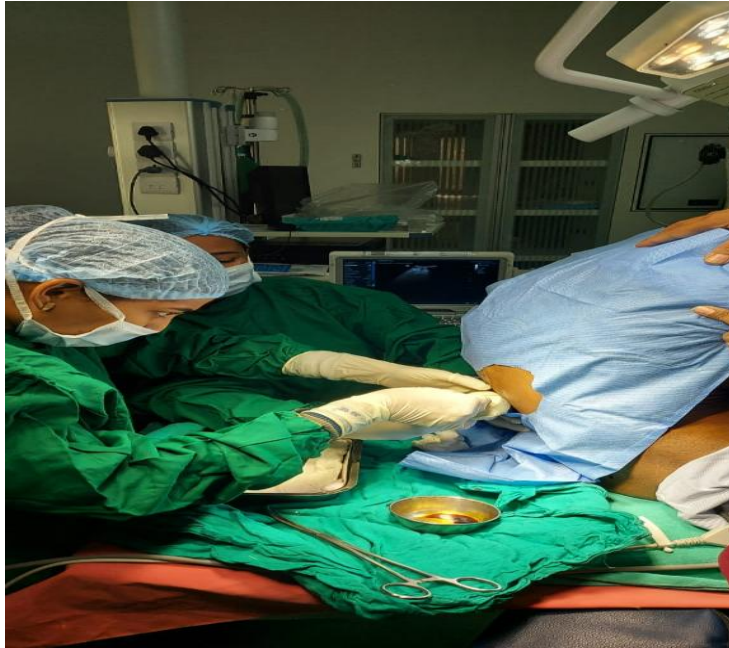
Fig 4. Operative period

be detected using a convex vertical probe. For spinal access, L2- L3 intervertebral space through which dura can be observed was selected. Under the guidance of US, subarachnoidal space was entered at the first attempt using a 23 G quinckes spinal needle directed 45°-60- degrees cephalad. After observing outflow of cerebrospinal fluid, 3.4 ml of bupivacaine heavy (5 mg/ml) was injected through the spinal needle slowly.