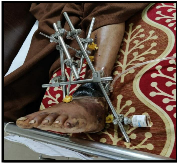
Figure 4 Post-operative clinical presentation of the ankle joint by using delta fixator