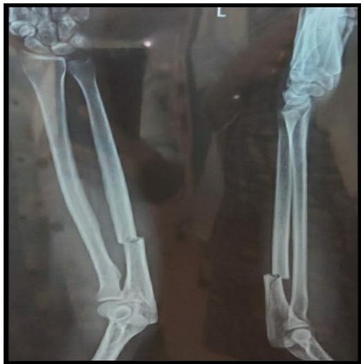
Figure 5 Pre-operative X-Ray of proximal 1/3 shaft of ulna fracture left side