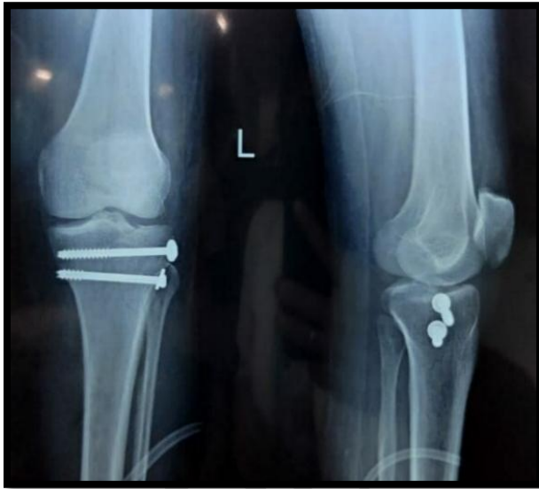
Figure 3 Post-operative X-Ray of tibial condyle where the screw was inserted from lateral to medial.