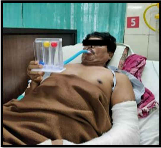
Figure 7: Patient performing Spirometry, Upper limb in a cast.