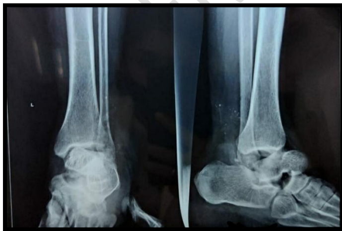
Figure 1 Pre-operative X-Ray of Compound grade 3B Ankle joint dislocation

The patient signed a written consent form. Physical examination and treatments were explained to the patient. On general examination, the patient appeared to be awake, well-oriented in terms of time, location, and person, and cooperative. The patient was hemodynamically stable, afebrile, and had a blood pressure of 129/76 mm Hg, a pulse rate of 74 beats per minute, and a respiratory rate of 19 breaths per minute. There were no signs of cyanosis, icterus, clubbing, or edema in the patient. In a supine posture, the patient was examined. The patient's left leg was gently raised on a pillow during the examination, and an external Delta fixator was attached to the ankle with VAC. Joints in the knees and hips are in a neutral posture. Near the ankle and the tibial tuberosity, there are scars and abrasions. On palpation temperature was normal. The swelling was visible throughout the knee and ankle. Tenderness of grade 2 was found on bony landmarks below the knee. On both limbs, range of motion and muscular strength were measured and compared. All sensations and reflexes were intact on neurological evaluation. There was no difference in limb length. X-rays are taken before and after surgery, as well as clinical pictures are shown in figure 1, 2, 3, 4, 5, 6