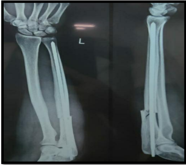
Figure 6 Post-operative x-ray of Open reduction Internal fixation for ulna shaft fracture.