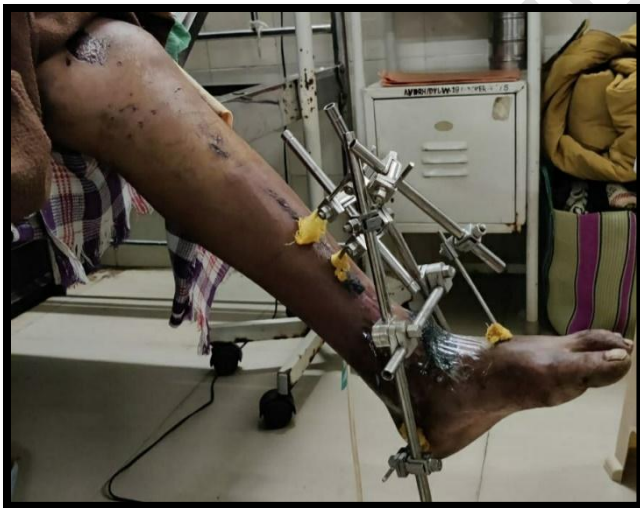
Figure 8: Patient performing active lower limb movement

Phase 2: [Two to Six Week] Many aspects of the phase one regime have been maintained as needed. The active and active-assistive ranges of motion in the left shoulder were initiated. Isometric flexion and extension exercises for the elbow and wrist. Isotonic digit exercises, Daily