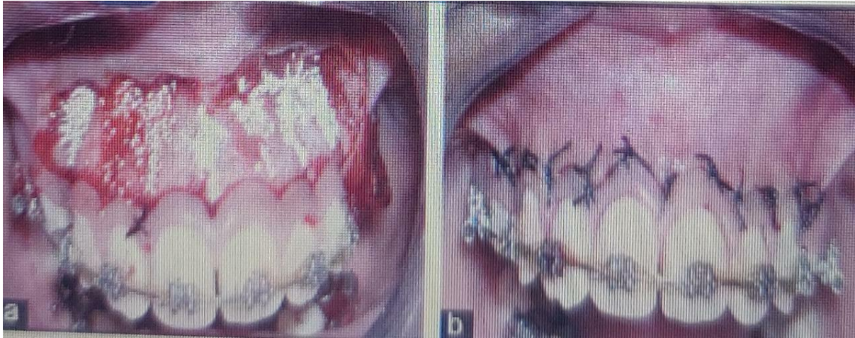
Figure2: (a and b) Sutures are put in the decorticated region and a particle alloplastic bone replacement is used.

The flaps are approached with materials that are non-resorbable using intermittent loop sutures. The flap should be closed with the least amount of force possible. A two-week timeframe is excellent for the formation of the joint of epithelium, and only after this period of time is passed the sutures are removed. [18] The overall procedure takes up to 8 to 10 days to finish. Analgesics and antibiotics are administered for 5 days, in the company of orthodontic apparatus, to permit flap manipulation and suturing. [15]