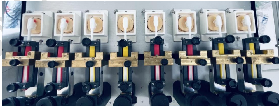
Figure 2: Image showing the subjecting of the two brands of GIC to standard and herbal toothpastes in a brushing simulator.