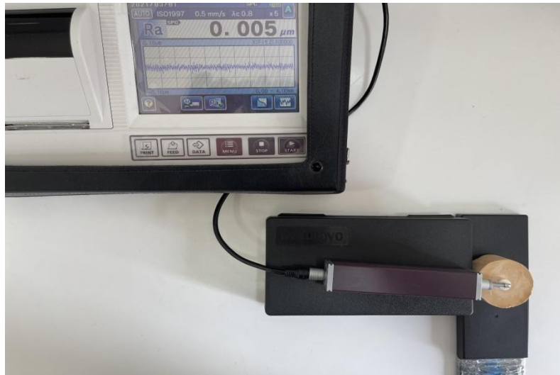
Figure 1: Image representing the measurement of surface roughness of the mounted GIC samples using a stylus profilometer.