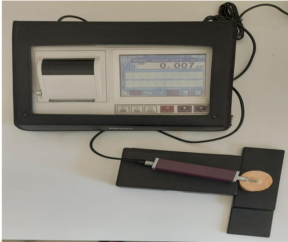
Figure 3 : Represents the stylus profilometer used to obtain the values of surface roughness.