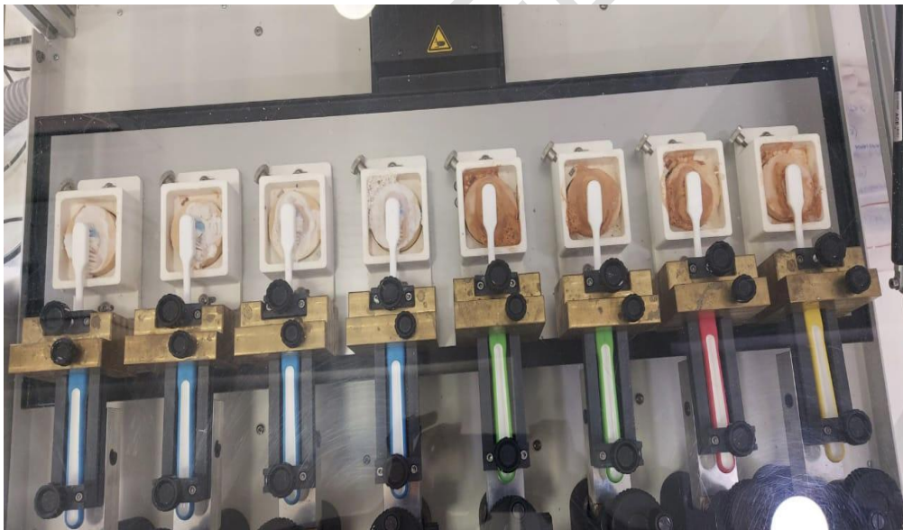
Figure 2: The image shows the samples placed in the brushing simulator.