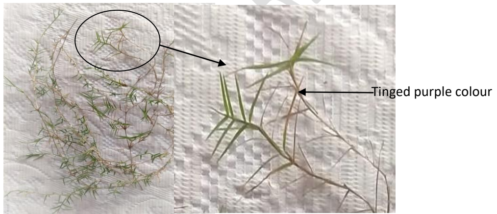
Fig 1: Cynodon dactylon

C. dactylon is one of the auspicious herbs of Ayurveda which constitutes the group 'Dasapushpam' [3]. It is a sacred plant in Indian culture next to Ocimum [4], mention of which has also been incorporated in early Graeco-Roman pharmacopeias due to its support to cattle rearing [5]. It belongs to Poaceae family, having tinged purple colour stems, and slightly flattened in shape (Figure 1).