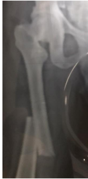
(Fig 2) male