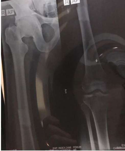
Pre-operative Xray (fig 1) male