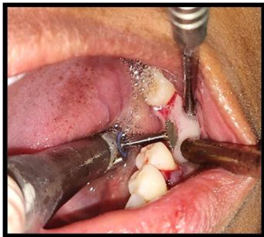
Fig. 4. Horizontal corticotomy done using microsaw