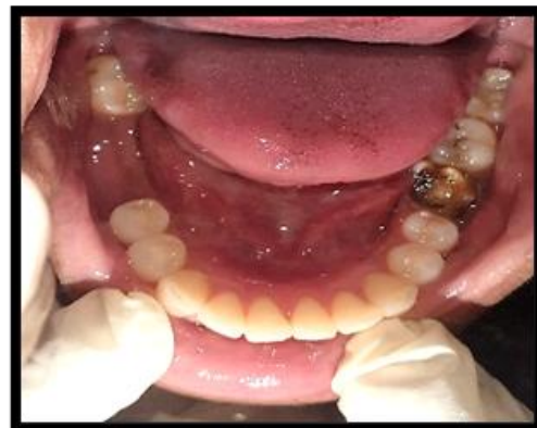
Fig. 1. Pre-operative situation

microsaw was performed (Fig. 4), located slightly lingually with respect to the centre of the edentulous ridge along the entire area which was to be expanded. The cut was maintained parallel to the outer contour of the buccal plate to give it a uniform thickness (Fig. 5). Chisels of increasing dimensions up to a width of 2.5mm were used to displace the buccal plate, producing a greenstick fracture (Fig. 6). The chisel was gently tapped on with a hammer to create a cut (Fig. 7). To spread apart the cortical plates, the same chisel was used as a lever. The fracture was extended to a depth of about 7mm for initial expansion which was subsequently increased till the implant length. Intact bone was left apical to this site to provide primary stabilization of the placed implants. Subsequently, the implant site was prepared (Fig. 8) using increasing sizes of the implant kit drills. Tapered spiral implants were positioned (3.75 * 10 mm) each with respect to teeth no's 36, 37 (Fig. 9). Acting as bone expander screws, the conical shape of the implants contributed to the completion of the ridge expansion. The flaps were approximated and interrupted sutures (4-0 absorbable) were placed (Fig. 10). Routine postoperative instructions were given. Patient was recalled after 1 week for suture removal.