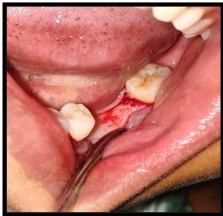
Fig. 3. Full thickness mucoperiosteal flap elevated to expose the underlying bone