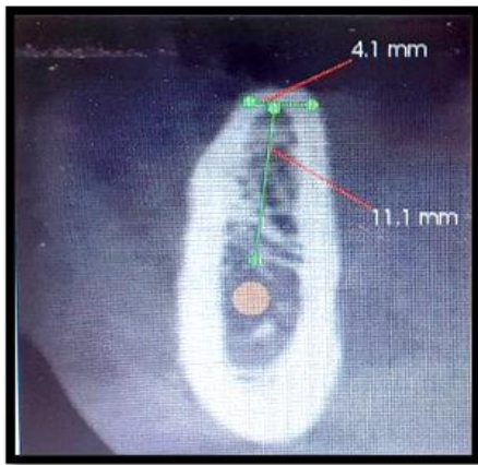
Fig. 2. CBCT section showing the available bone height and width