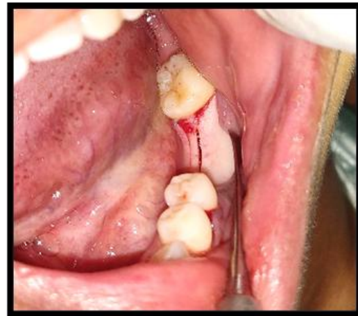
Fig. 5. Horizontal corticotomy done