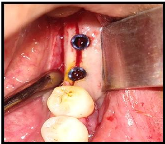
Fig. 9. Two implants (3.5 × 10 mm) each placed in the prepared osteotomy site