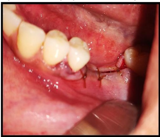
Fig. 10. Interrupted absorbable sutures placed to achieve primary closure of the operative