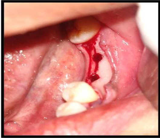
Fig. 8. Final osteotomy site