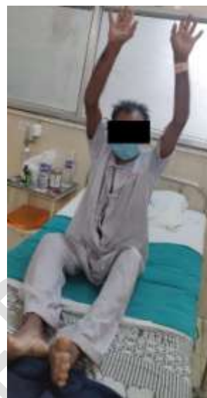
Fig 3. Patient performing