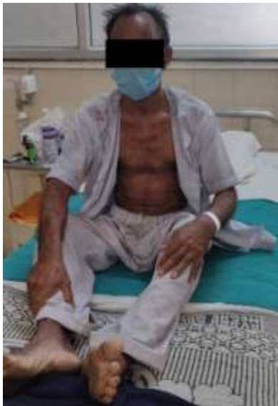
Fig 2. Patient in long sitting