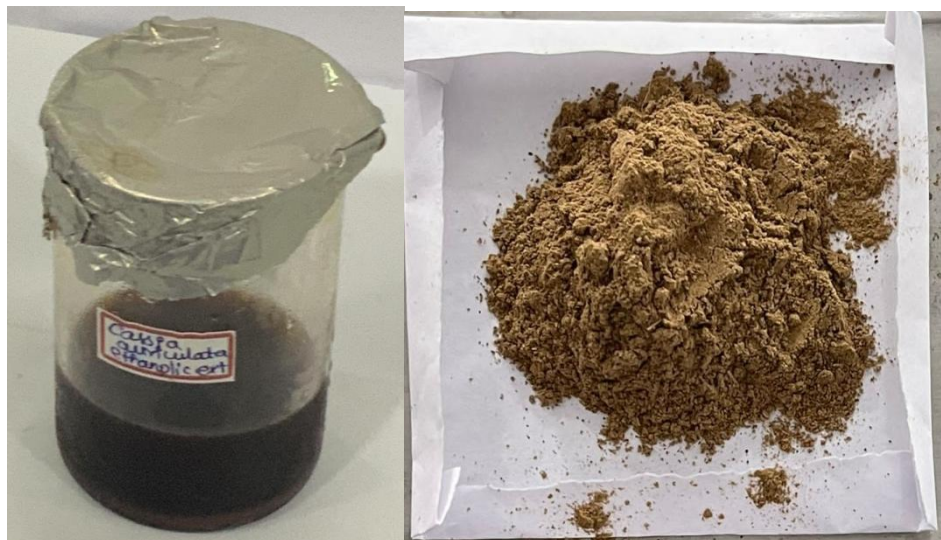
Figure 1: Image showing the Synthesis Cassia auriculata ethanolic extract

The results of anti-inflammatory activity and egg albumin assay were depicted in (Figures 1-2). In the present study, the total anti-inflammatory of Cassia auriculata ethanolic extract (CAE) was determined using the egg albumin assay method. CAE Ext showed anti-inflammatory property in a concentration dependent manner. The result indicated that the CAE Ext significantly ( <0.05 ) inhibited albumin Denaturation Assay method. Egg albumin assay is an easy, rapid and sensitive method for the anti-inflammatory screening of plant extracts. The present study investigated the anti-inflammatory activity of CAE Ext, and expressed the inhibition of albumin denaturation Assay using BSA as standard reference.