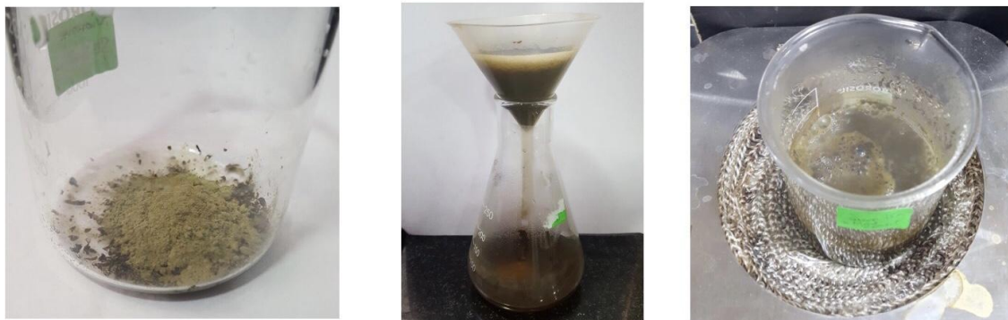
Figure 1: Synthesis of herbal formulation of Green tea and Mint .