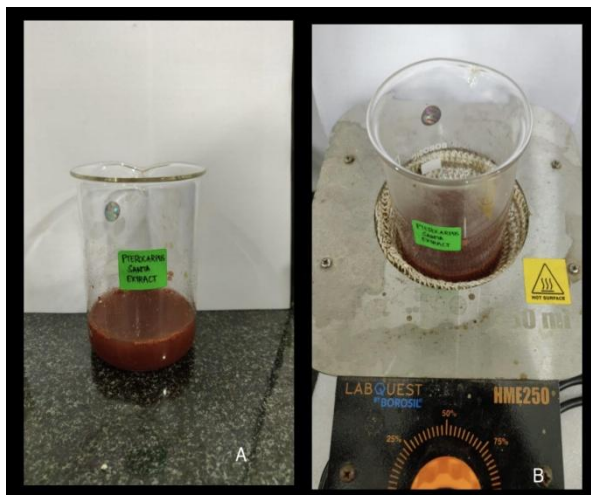
Figure 1: Synthesis of P.santa mediated selenium nanoparticles .