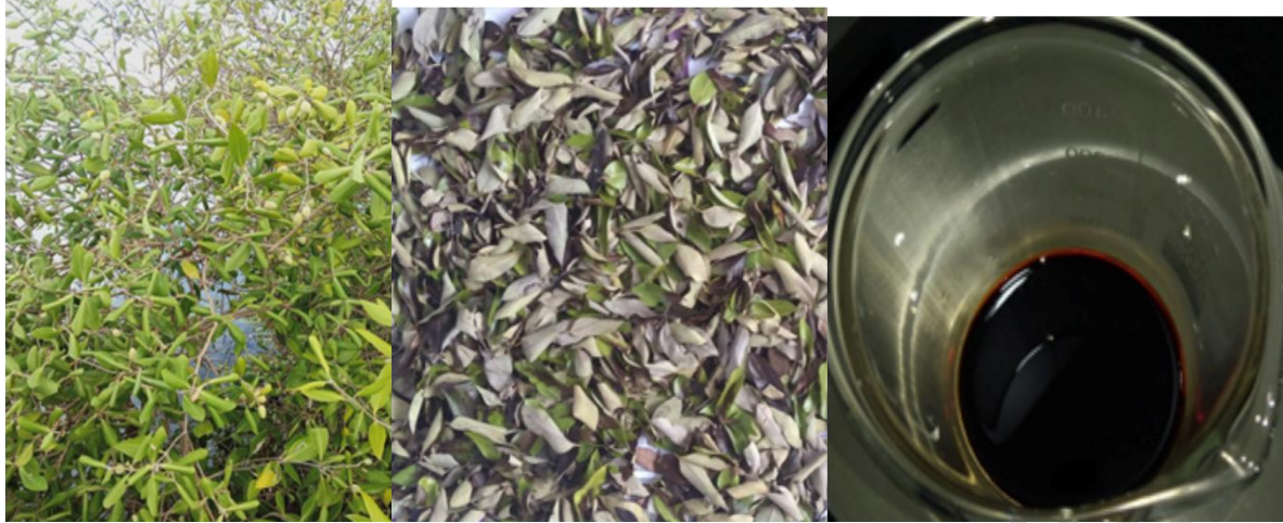
Figure 1: Collection of Avicennia marina plant collection and preparation