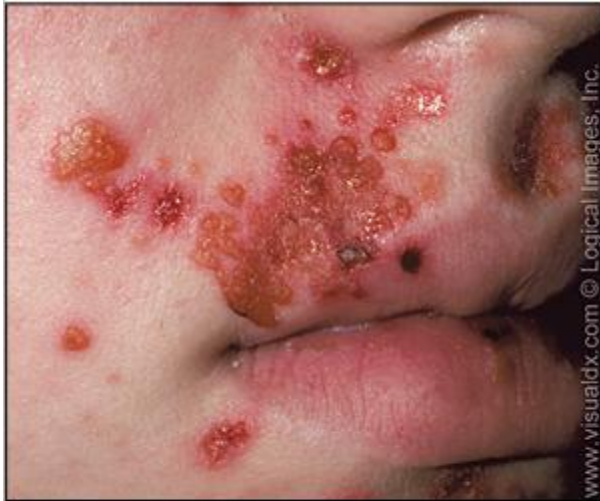
Figure 1. Honey-colored crust of nonbullous impetigo.

has been verified but at low levels. As it belongs to the fusidanes group, it has a very different chemical structure from that of other classes of antibiotics, such as betalactams, aminoglycosides and macrolides, thereby reducing the possibility of cross-resistance. The incidence of allergic reactions is low and cross-allergy has not been seen. This antibiotic is not marketed in the United States. (22) Unlike in Europe, in Brazil it can only be found as 2% cream, being thus unavailable for oral use. (23)