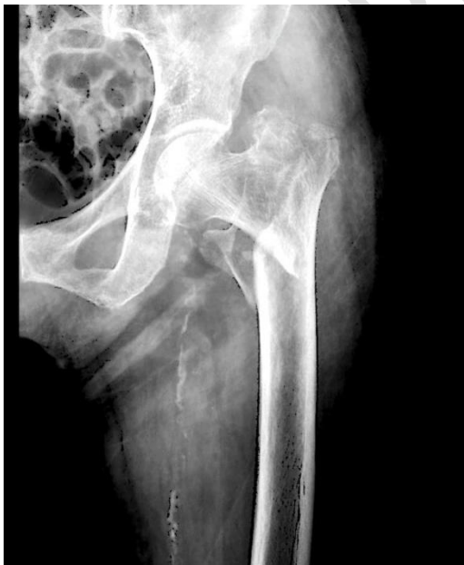
Figure 1- Shows preoperative X-ray of Neck of femur fracture