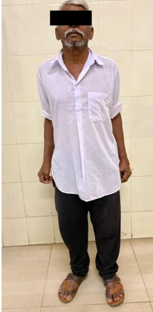
Fig 1: POSTURE: Standing