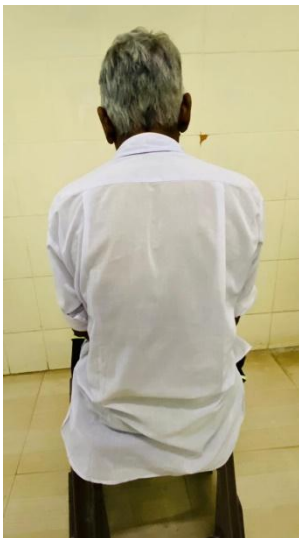
Fig 2: POSTURE: Sitting