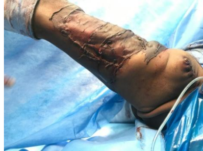
Fig. 5- postoperative image showing the flap