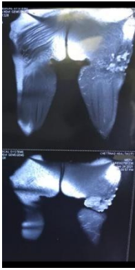
Fig.2- MRI image of left thigh showing invasive lesion in gluteal region involving cutaneous, subcutaneous fat and underlying muscle layer.