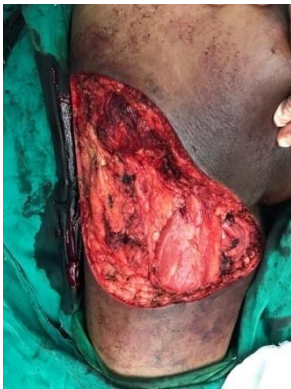
Fig. 3- Intra operative image showing the tumour bed.