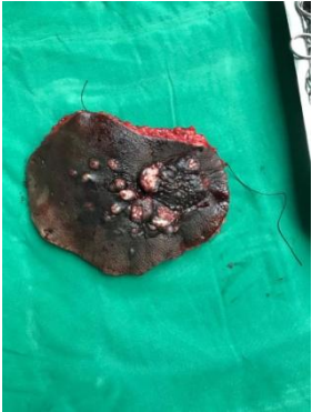
Fig. 4- specimen image. cover.