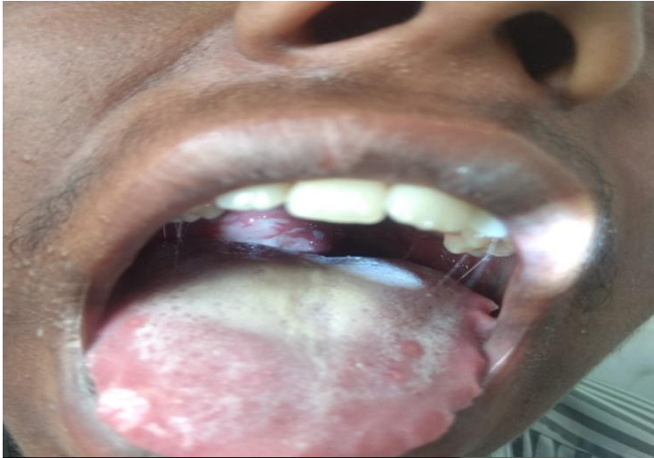
Fig-1 shows coated tongue and tonsillar enlargement with white patch over the tonsil