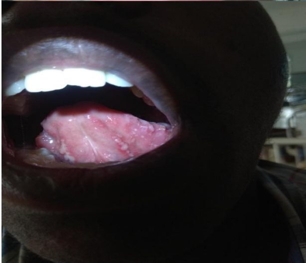
Fig-2 shows multiple ulcers over the tongue