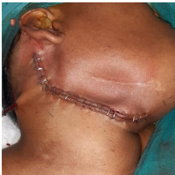
Fig. 4. Closure