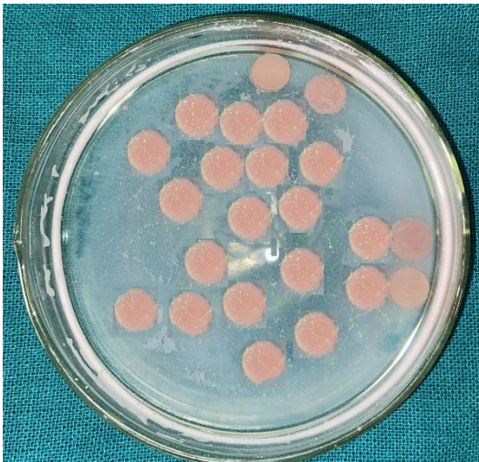
Figure 4A- samples immersed in the solution prepared using neem

2.3.1 Procedure for immersion- All the samples were immersed daily in cleanser for 8 hour and then transferred to artificial saliva for rest 16 hours of the day. Solutions of artificial saliva and denture cleanser was changed daily for the entire period of study that is 7 days as shown in figure 4. Later, all the test samples were removed from saliva, wiped dry, weighed for saturated weight W2.