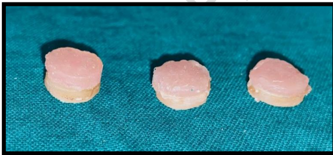
Figure 3- Soft liner bonded to acrylic resin