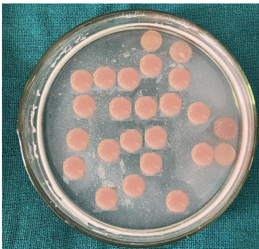
Figure 4B- samples immersed in the solution prepared using clinsodent

2.3.2 Weighing - After desiccating again for 24 hours the samples were again assessed for renovated weight that is W3. An automated weighing apparatus with a precision of upto two decimal points of milligram was conditioned to weight the samples as shown in figure 5. Sorption and solubility formula given by ADA specification-12