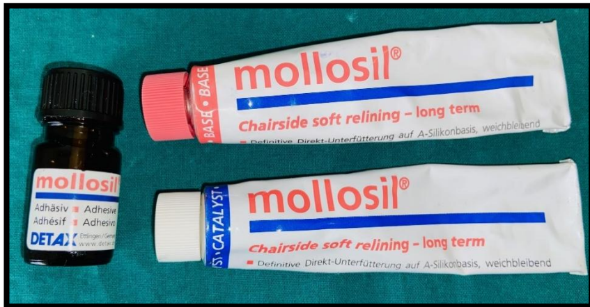
Figure 2- Relining material