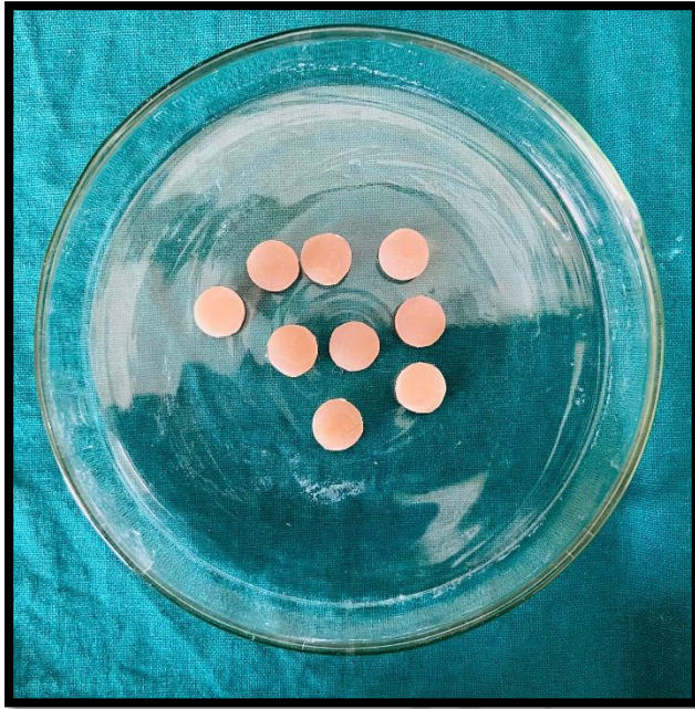
Figure 1- acrylic discs

as a separating medium in the mold. The powder and liquid of the heat cure denture base resins were manipulated as recommended by manufacturer and was packed within the mold with cellophane sheets interposed between the inner and outer mold covering plates. After the trial closure, the excess material and the cellophane sheets will be removed and the mold was then placed in an acrylizer with a temperature of 70°C up to 1 hour, and subsequently raised to 90°C for 2 hours for polymerization of denture base material. After the final curing specimens with obvious porosities were discarded.