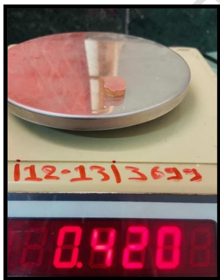
Figure 5- weighing of the samples

Surface area of disc – 2 \pi r (h + r) = 2 \times 3.14 \times 0.1 (10+3) = 8.16 \text{mm}^2