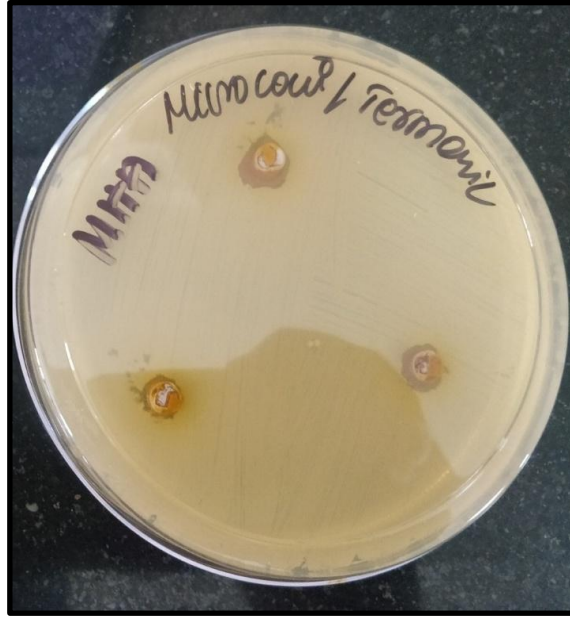
FIGURE 1: The image shows the zone of inhibition of turmeric against micrococcus