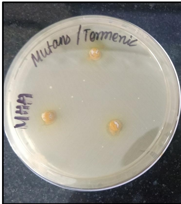
FIGURE 2: The image shows the zone of inhibition of turmeric against Streptococcus mutans ,