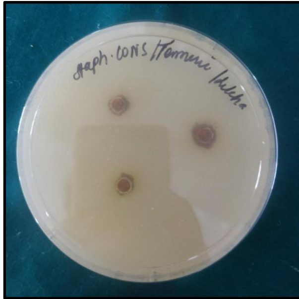
FIGURE 3: The image shows the zone of inhibition of turmeric against Coagulase-negative staphylococci