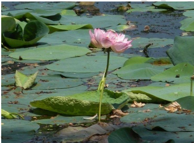
Fig 2: Kamal