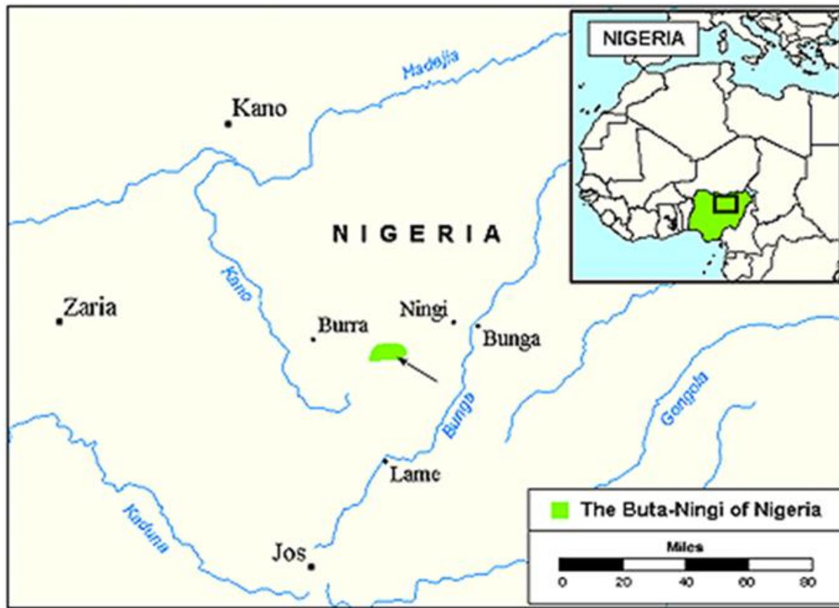
Figure 1 Scalar Position of Ningi graphite deposit with respect to the Map of Africa