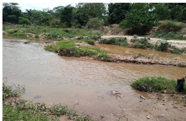
Fig. 6. Ekulu River in a less active area (below Abakpa Bridge). Nylon, plastic containers and wood debris were deposited as part of sediments on the present channels and bars of the river