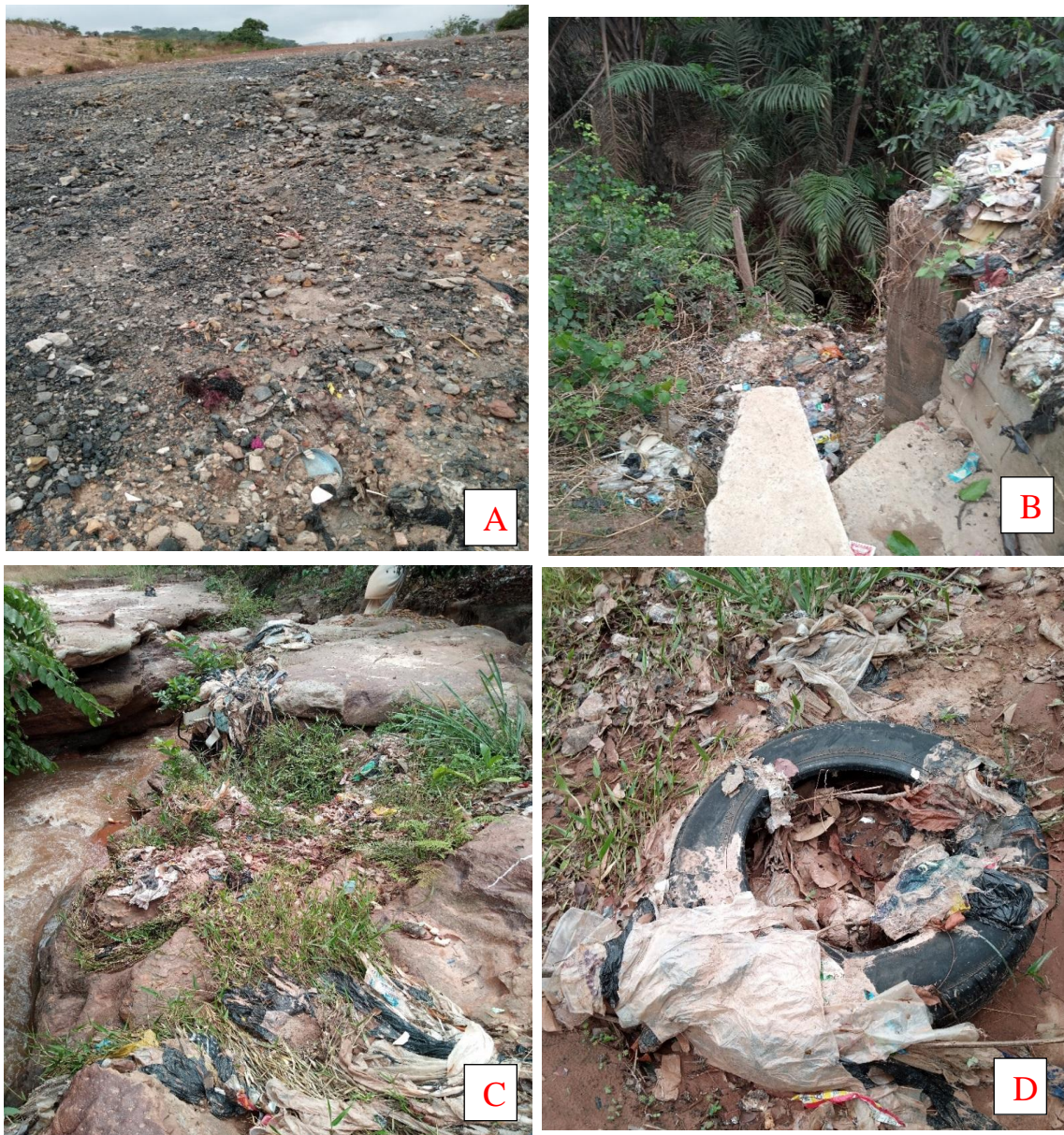
Fig. 4. On- going activities on location 1; (a) Abandoned coal mine waste dumped above the ancient and present terraces of the river that is being washed down the river channel by rain (b) Waste dump at the margin of the river also being moved down into the river channel especially during the rainy season (c &d) Exposed on- going sedimentation at the present river channel situated below the dumpsites. These sediments are exposed owing to fall in water level due to dry season