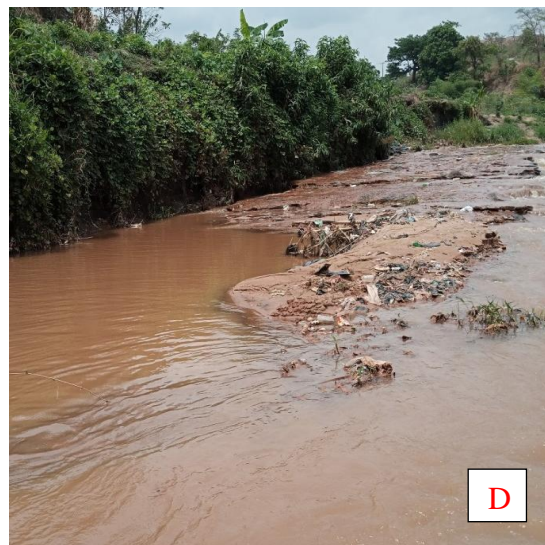
Fig. 5(a &b). Fluvial sedimentation on the outer and inner (point bars) parts of the present meander channel. The sediments are exposed due to fall in water level during dry season (c& d) Exposed braided bars sediments of the present river