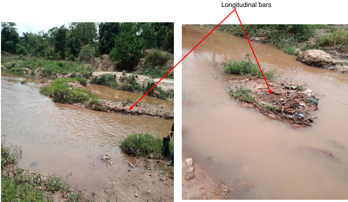
Fig. 2. Braided channels of the Ekulu River showing the longitudinal bars