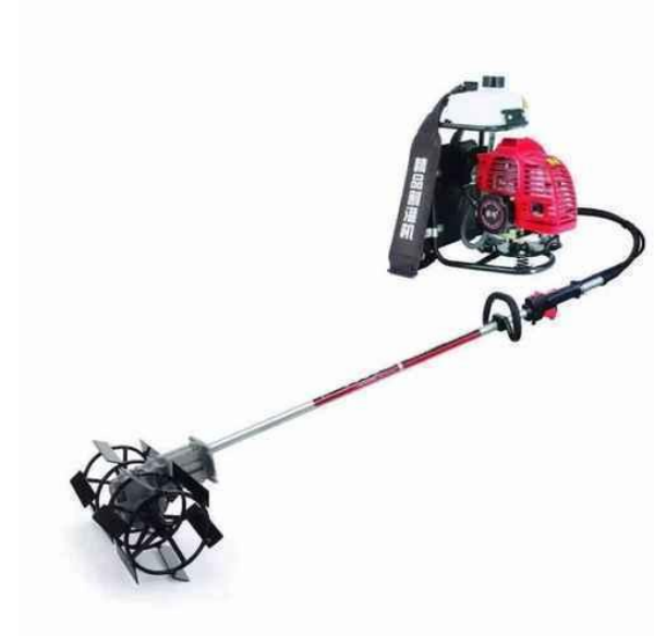
Figure 1. Back pack weeder