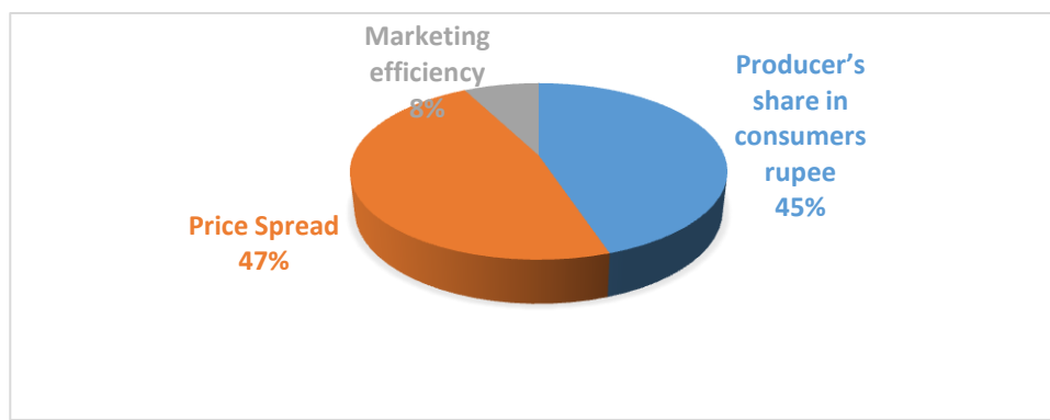
Fig 1: Marketing cost in marketing of paddy through Channel I.

Table 1 reveals that marketing cost, marketing margin, and price spread for channel I, where paddy reaches to the consumers directly. Average marketing cost when producers sold the consumer is Rs 1700/q. Among these, cost transportation Rs.25/q, loading and unloading cost Rs. 28.57/q, packing material cost Rs. 24/q, weighing charges Rs.10/q, and miscellaneous charge cost Rs 12/q, respectively. Sale price of the producer to the Consumer was Rs.1700/q