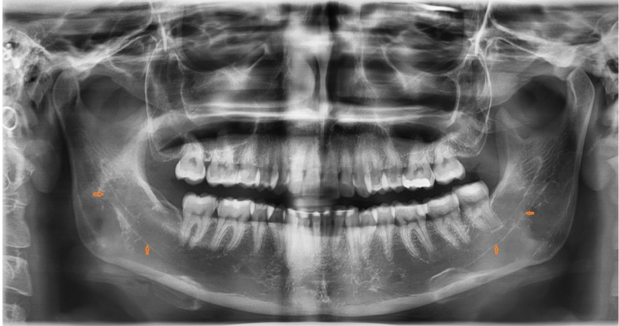
Figure 1: Digital panoramic radiograph showing the path of the MC (arrows)

However, this 2D technology lacks 3D information and may not visualize the small details of the MC [24]. Additionally, the MC visibility decreases when its borders become undetectable due to poor bone density or a non-perpendicularity between the canal and the principal beam [27]. Less resolution, elevated distortion and the risk of phantom images are also main disadvantage of this technique [28].